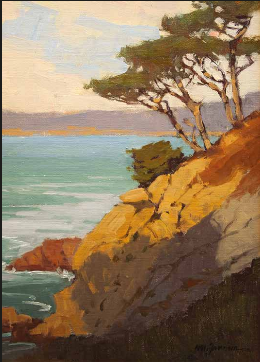
Mark Farina Point Lobos Pines Oil 12" x 9"