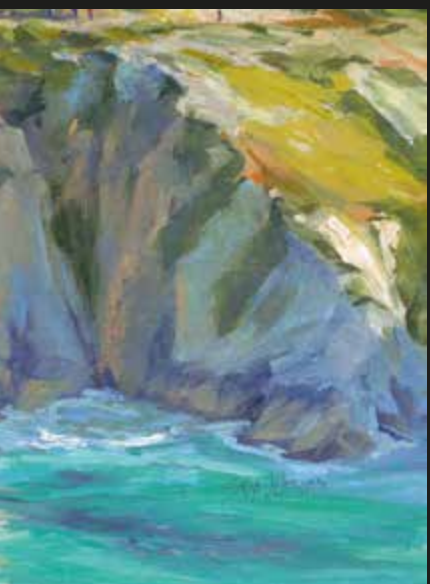
Sibyl Johnson South Plateau Trail Oil 12" x 16"