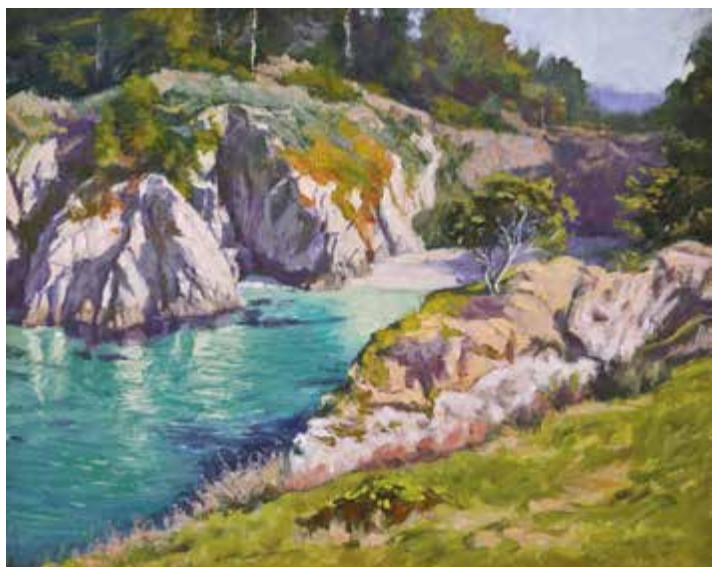
Nanette Biers Bright Morning, China Cove Oil 9" x 12"