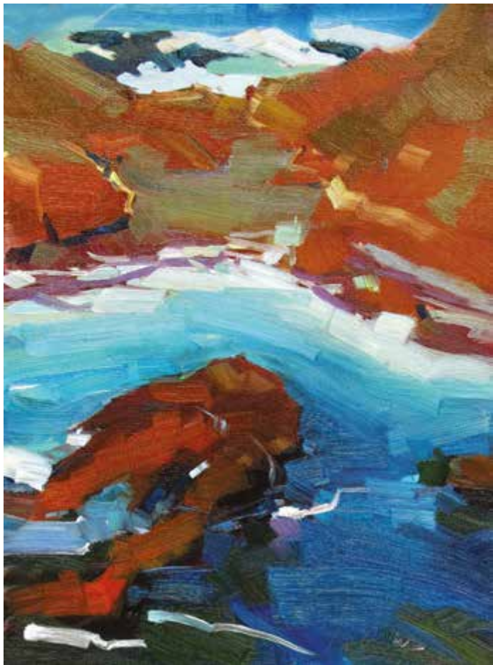
Ann McMillan Point Lobos Water Oil 24" x 18"