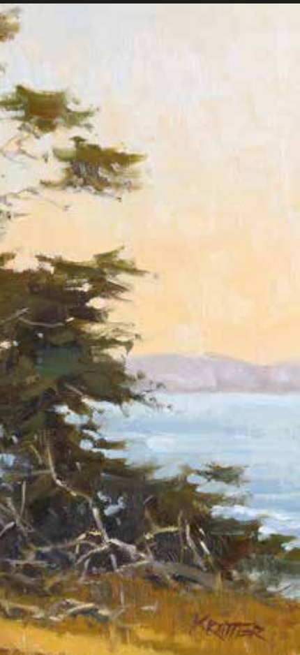
Paul Kratter Entangled Oil 12" x 12"