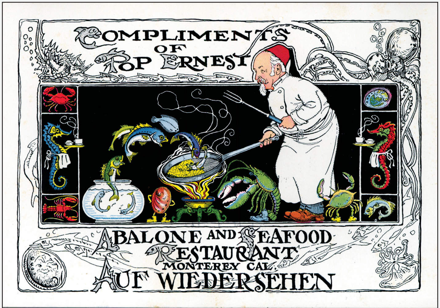
Detail of the menu created by Jo Mora for Pop Ernest's Abalone and Seafood Restaurant, late 1920s. Below, contemporary shrine to Monterey in the Chiba Prefecture of Japan.