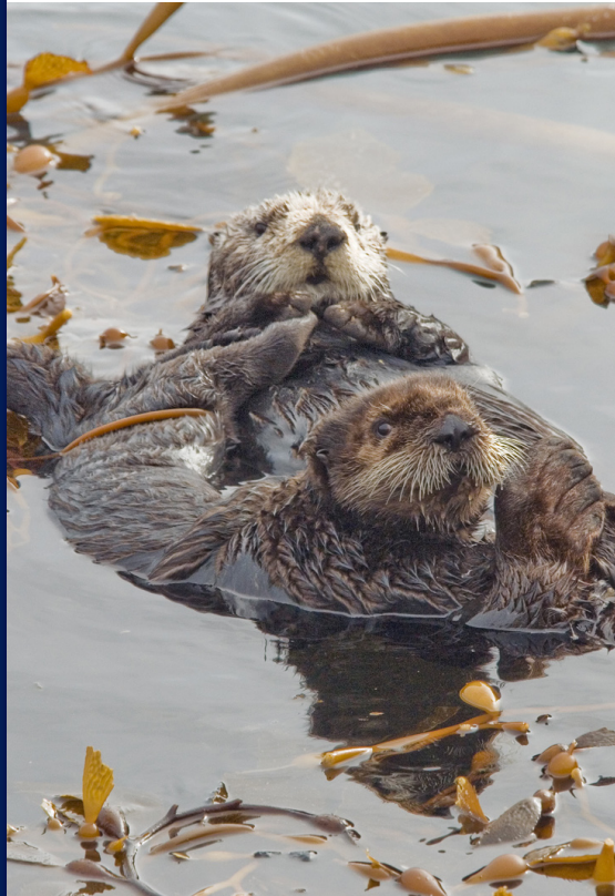
"Sea Otters"